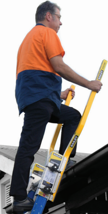
See Rung or Pole strap need to be removed.

The BAILEY STEPTHRU SAFETY DEVICE is easily clamped onto the top of extension/single ladders enabling you to simply, step through the ladder on and off the supporting structure. The revolutionary device makes your worksite safer and more efficient in one simple and easy to attach product and the highly visible design ensures that your workers always know the location of the safe access point.