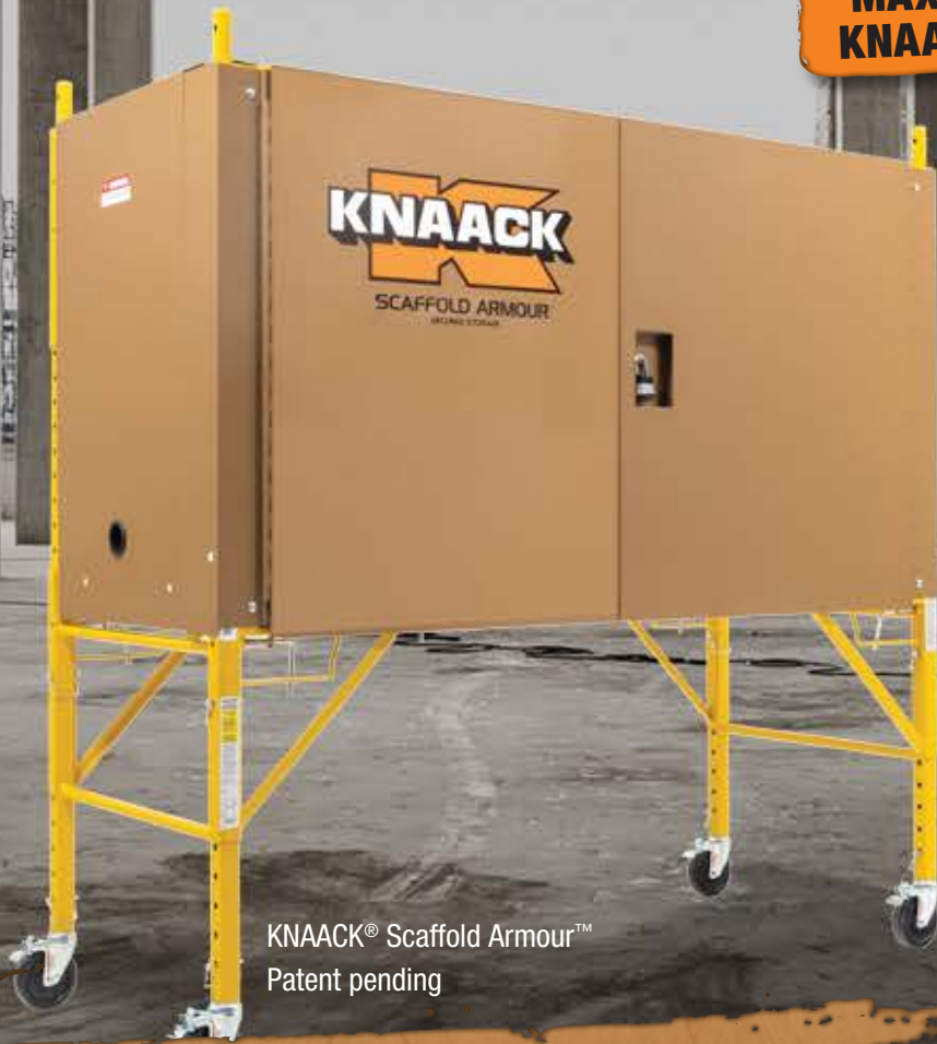
KNAACK® Scaffold Armour™ Patent pending

MULTI-FUNCTIONAL VERSATILITY. MAXIMUM MOBILITY. KNAACK® DURABILITY.