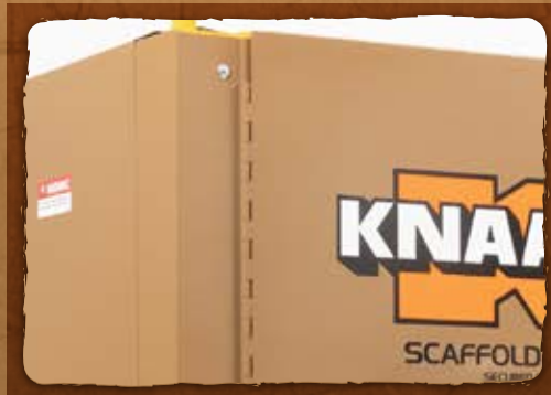
Heavy Duty Construction